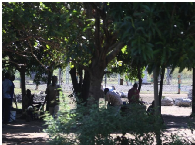
Unsecured electrical cable (Zambia Electrical Supply Corporation)