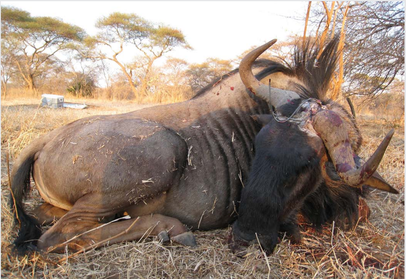
Wounding caused by a snare on a wildebeest in Savé Valley Conservancy, Zimbabwe (this animal broke the snare from the tree to which it was attached, and was euthanized after being seen with the snare embedded in its skull)

In recognition of the threat posed by the bushmeat trade, the Convention on Biological Diversity (CBD) has established a liaison group on bushmeat. This liaison group has since established a set of recommendations for addressing the threat (Secretariat of the Convention on Biological Diversity, 2011). These guidelines were used as the basis for discussion at a brainstorming session held in May 2012 by Panthera, the Zoological Society of London and the Wildlife Conservation Society where scientific experts and wildlife managers met to identify priority interventions needed to address illegal hunting and the bushmeat trade in the savanna biome, with particular (though not exclusive) reference to the Southern African Development Community (SADC) region.