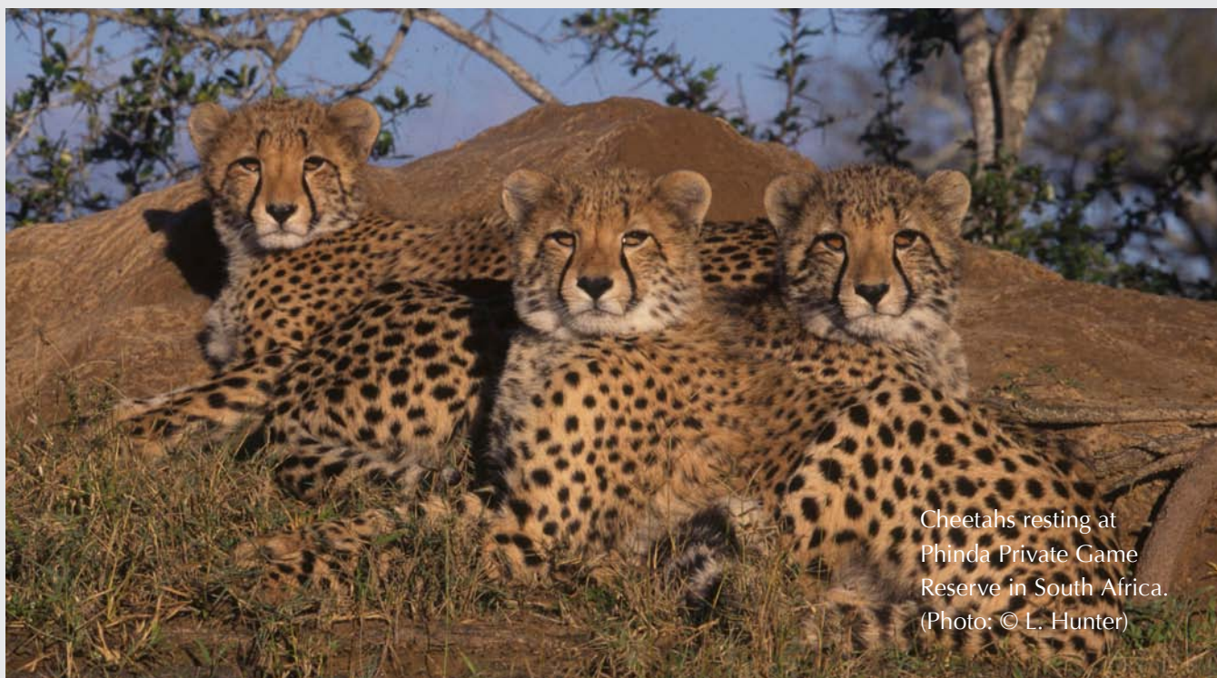
Cheetahs resting at Phinda Private Game Reserve in South Africa.

Hunting of wildlife is regulated in most African countries through wildlife legislation and permitting systems which specify restrictions on the times and places that hunting is permitted, the species that may be hunted and the hunting methods that may be used. The large majority of hunting for bushmeat contravenes one or more such restrictions. Snaring is the most common illegal hunting method and is particularly undesirable from a conservation perspective as it is highly effective, difficult to control, unselective in terms of the genders or species of animals captured, wasteful, and has severe animal welfare implications due to the manner of capture and confinement, and frequent incidents of severe, non-lethal wounding of wildlife. Other common bushmeat hunting methods include the use of rifles, muzzle-loaders, shotguns, dogs, fire, and in some cases, gin traps, pitfall traps and poison.