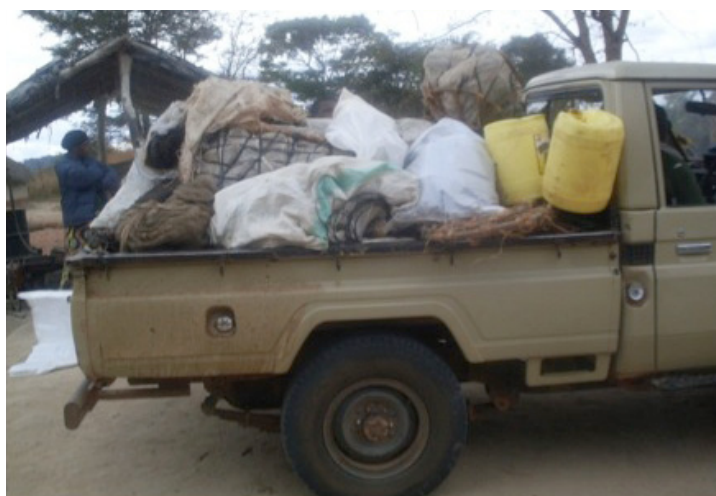
Bushmeat being transported by bicycle, central Mozambique. Bushmeat that was confiscated by traders who were transporting it by car, Zambia

The degree of secrecy with which bushmeat is traded likely reflects the quality of enforcement and degree of risk associated with the trade. In rural Maputo District, bushmeat is often traded in open-air markets, suggesting that enforcement and fear of reprisal among traders is minimal (Barnett, 1998). In Central Mozambique, by contrast, children are often used to sell bushmeat along roads as they are likely to be treated leniently by the authorities (C. Bento, unpublished data). Generally, however, in southern Africa, bushmeat is traded covertly, suggesting that there is at least some degree of enforcement in most countries (Barnett, 1998).