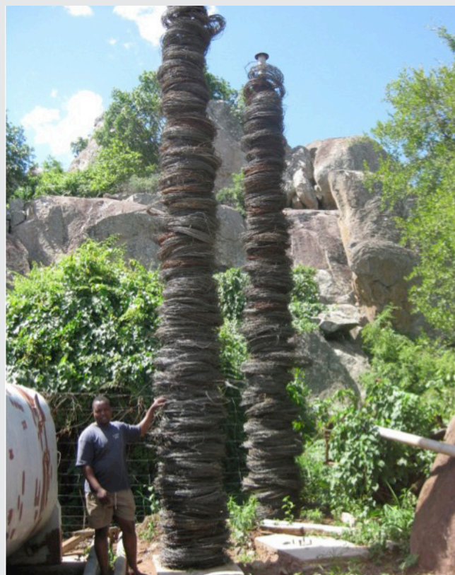
Snares removed from a single ranch in Savé Valley Conservancy, mostly comprised of wire stolen from the perimeter wildlife-proof fence.

and the methods commonly used by bushmeat hunters are typically illegal (Table 1). Hunting for bushmeat is typically illegal in many of the contexts in which it occurs due to varying combinations of: lack of licenses/permits; being practised in areas where hunting is prohibited; the use of prohibited methods; and the killing of protected species, sexes or ages of animals. Bushmeat hunting is thus hereafter referred to as ‘illegal hunting’. The term ‘bushmeat’ is used to describe meat from wildlife that has been acquired via illegal hunting, whereas ‘game meat’ is used to describe meat from wildlife that has been hunted legally.