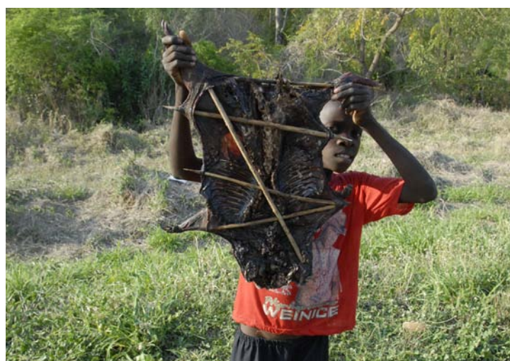
Child selling dried bushmeat on a roadside in central Mozambique