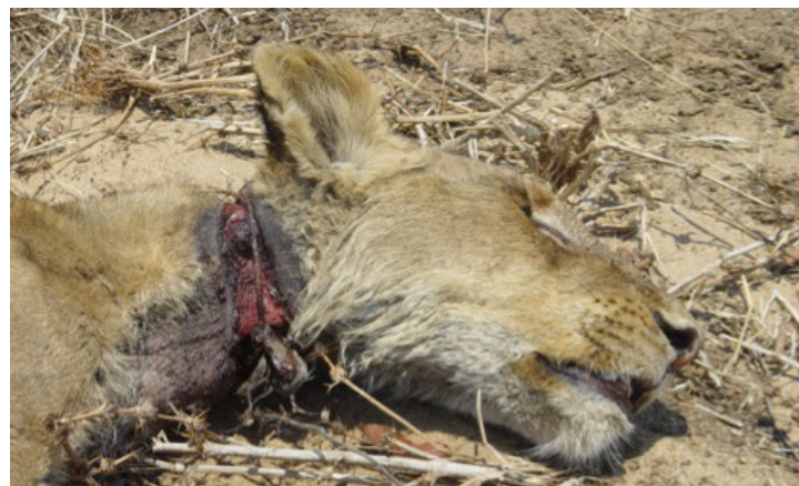
Lion killed in a snare, Luangwa Valley, Zambia