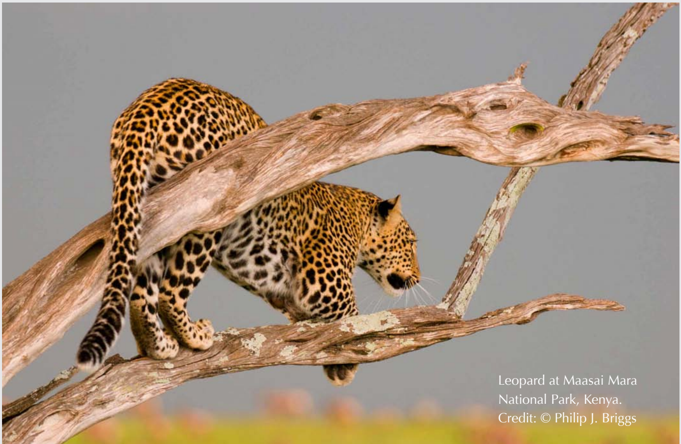
Leopard at Maasai Mara National Park, Kenya.

Urgent efforts are required to raise awareness among policy-makers and the international and donor communities of the severity and urgency of the threat posed by illegal hunting and the bushmeat trade. Failure to address the problem will have dire consequences for biodiversity conservation, will preclude the sustainable use of wildlife as a development option and have long term negative impacts on food security.