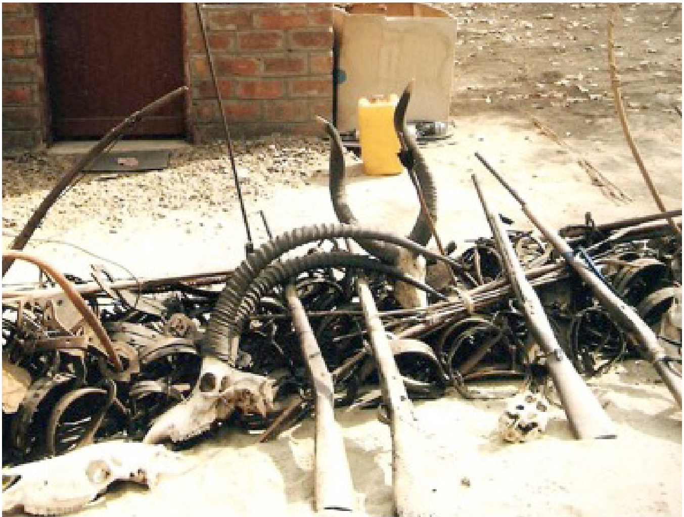
An array of poachers tools (including home-made muzzle-loader firearms) confiscated from illegal hunters in Coutada 9, Mozambique

The effectiveness of efforts to replace bushmeat consumption with alternative protein supplies may be increased by interventions designed to increase the price and/or reduce the supply of the former. In rural areas, bushmeat is typically preferred because of its availability and cheapness (Barnett, 1998), and so undermining those qualities could reduce consumption. The supply (and thus the price) of bushmeat could be curtailed by providing hunters with alternative livelihood options, through elevated anti-poaching efforts and through imposing controls on the transport of bushmeat. In urban areas where preference for bushmeat is driven primarily by taste, key interventions are likely to be providing legal and sustainable supply of game meat while increasing the price of illegal bushmeat through controls on supply of the commodity.