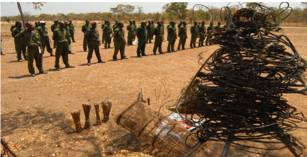
Elevated investment in anti-poaching security is needed in many wildlife areas

There are also challenges associated with the practical implementation of anti-poaching. Anti-poaching is expensive, specialized and can create animosity if not handled in a sensitive manner and if not coupled with efforts to extend benefits from wildlife to communities (Keane et al., 2008).