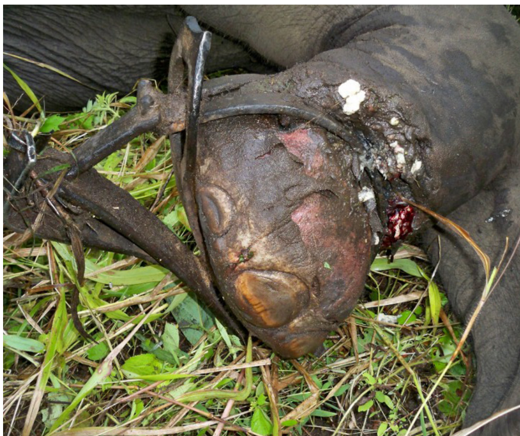
Elephant caught in gin trap

in reduction in trophy revenues from Burigi and Biharamulo Game Reserves from US$103,100 in 1994 to US$33,670 in 1998 (Jambiya et al., 2007). Ecotourism operations are likely to be even more sensitive to illegal hunting, because the viability of such operations is typically dependent on the presence of high densities of habituated wildlife (Lindsey et al., 2006). For example, in the Makuleke concession of Kruger National Park in South Africa, ecotourism operators (and the community owners of the land) ran at a loss for the first six years of operation due to depleted wildlife populations resulting from illegal hunting (C. Roche, Wilderness Safaris, pers. comm.). Animals with snare wounds also have potential to create significant negative publicity for tourism companies and wildlife destinations.