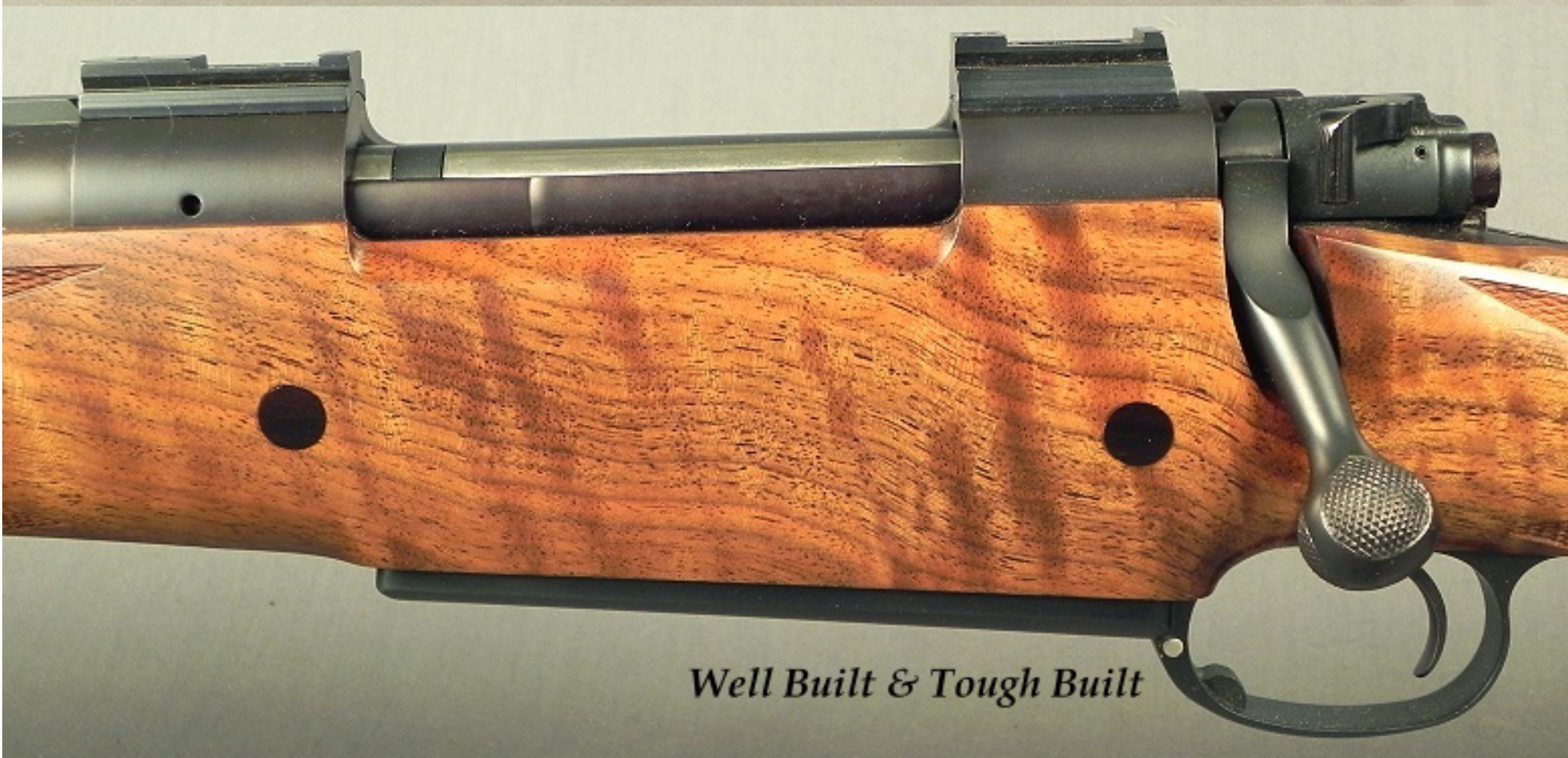
Well Built & Tough Built