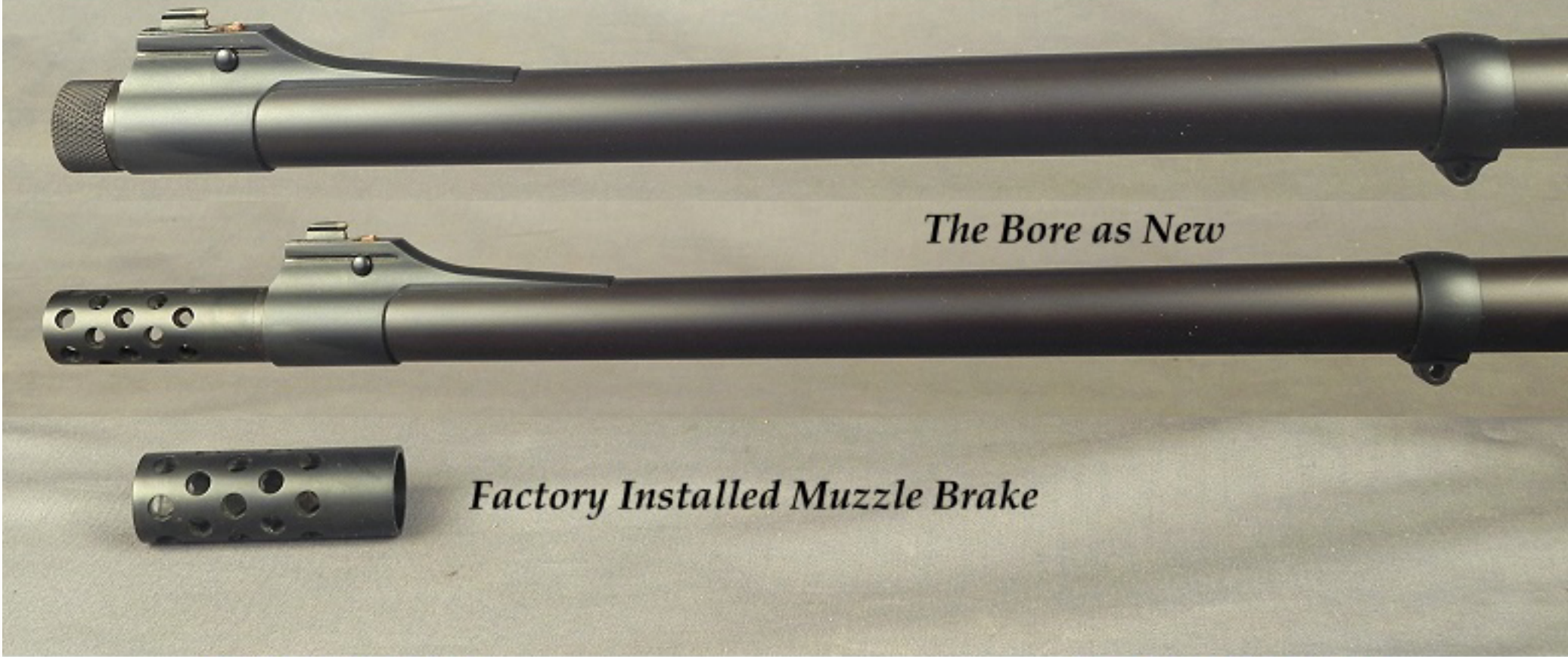
The Bore as New