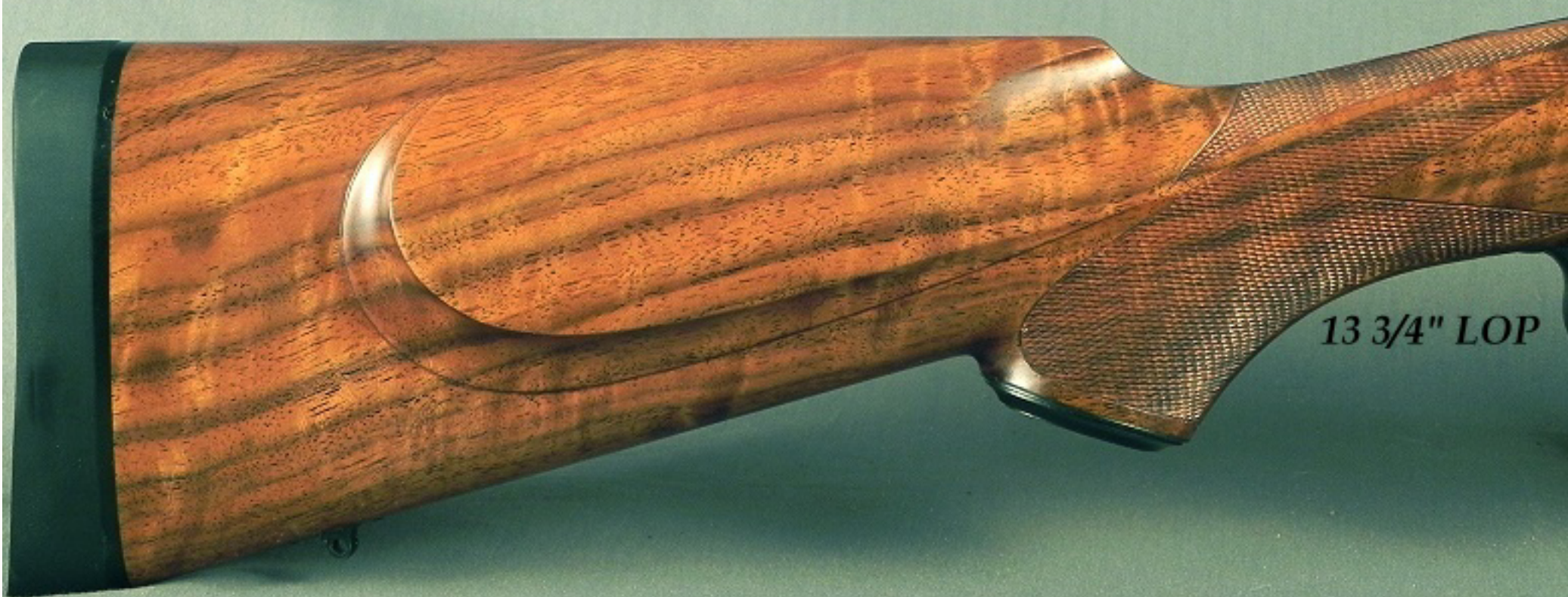
13 3/4" LOP