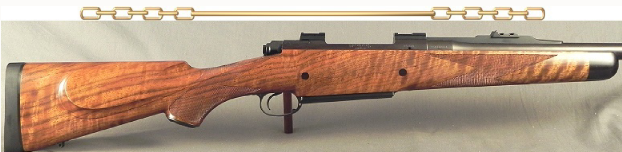
Dakota 450 Dakota Left Hand African Grade - Remains in Overall 98% Condition

The .450 Dakota is a potent .458 caliber cartridge based on the .416 Rigby case. Case capacity is near identical to the .460 Weatherby, the main difference between the two cartridges being that the .460 is loaded as fast as possible, while using maximum possible freebore to alleviate excessive pressures. The .450 Dakota with a 500-grain bullet has a muzzle velocity of 2450fps. This Dakota proprietary cartridge was designed by Don Allen and is like the .450 Rigby based on the .416 Rigby case necked up to accept a .458 diameter bullet.