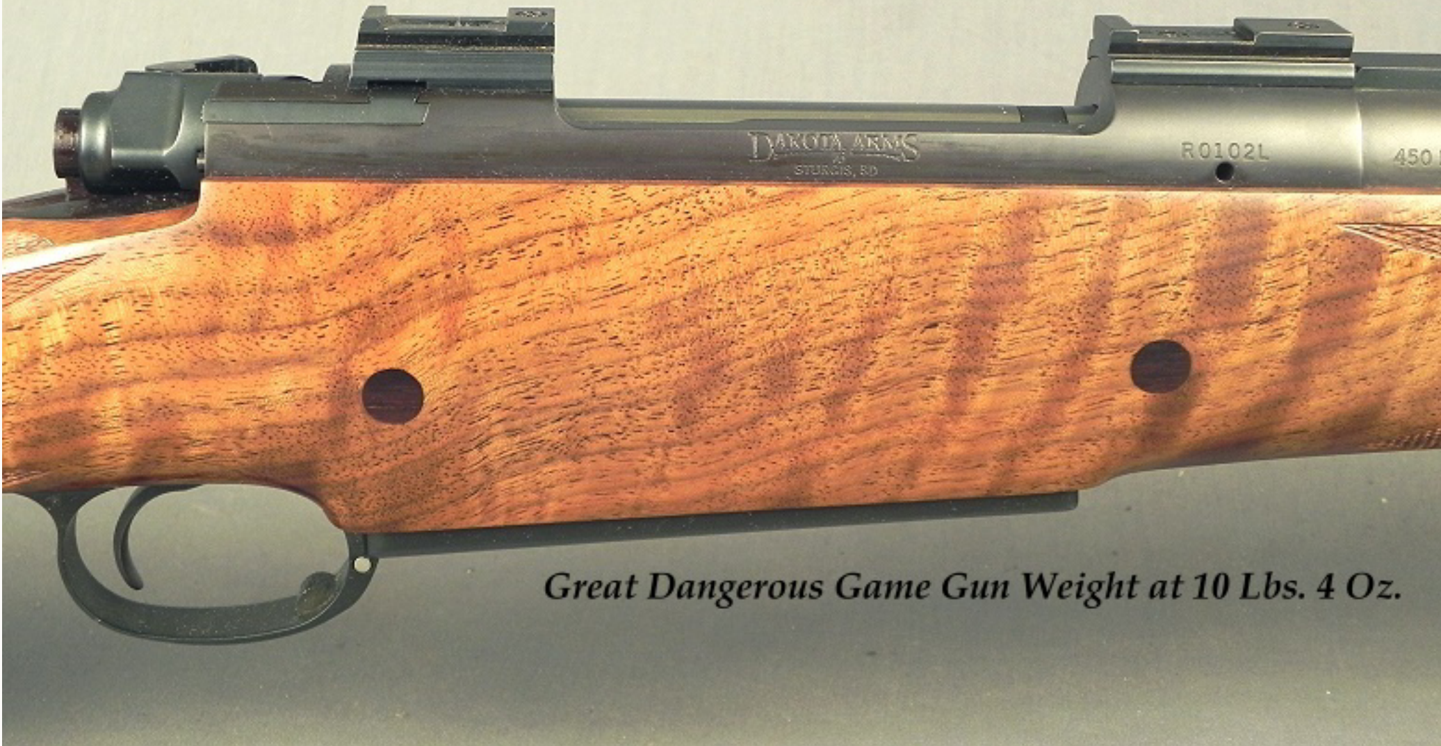
Great Dangerous Game Gun Weight at 10 Lbs. 4 Oz.