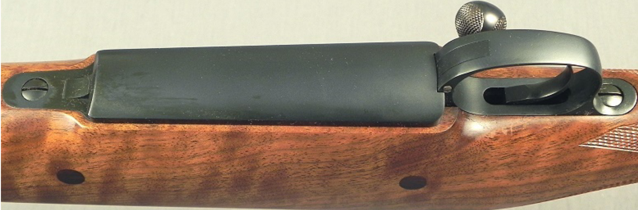
Deep Magazine Box