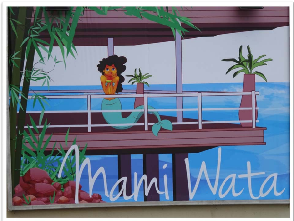
Mami Wata Restaurant Brazzaville