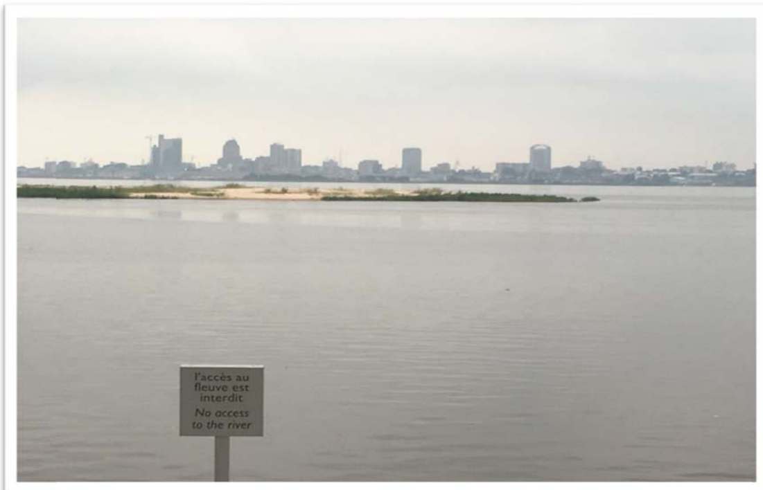
View of Kinshasa City 8 Miles away from Radisson Blu Garden