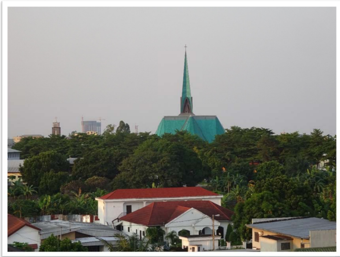
View from Mikhael's Hotel Room