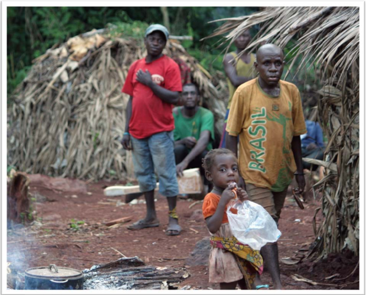
Baka huts in Forest