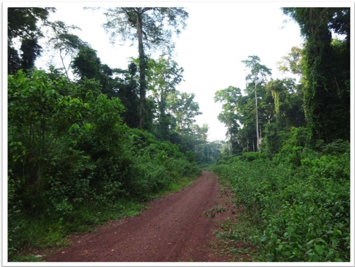
Route to Hunting Area