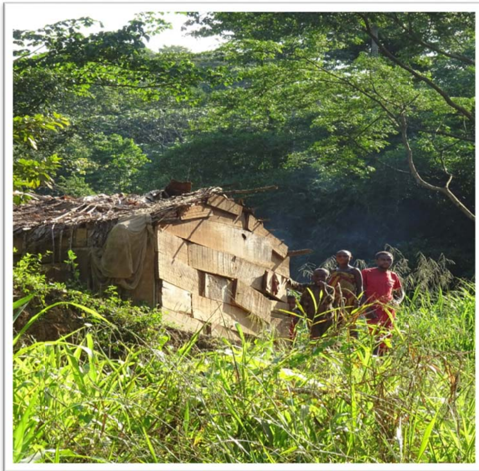
Baka Huts on way to Hunting area

We managed to clear a number of big trees over the course of the afternoon, although it was not without a little excitement, when at some stage we disturbed a Black Mamba. I'm not sure which moved faster the Snake, or the terrified Pygmies who bomb-burst from the zone shouting "Nyoka, Nyoka". In summary, it became apparent from the first few minutes on day one that the day would not be productive in terms of hunting, so it seemed sensible to focus on preparation for later hunting days by working on the routes and tracks.