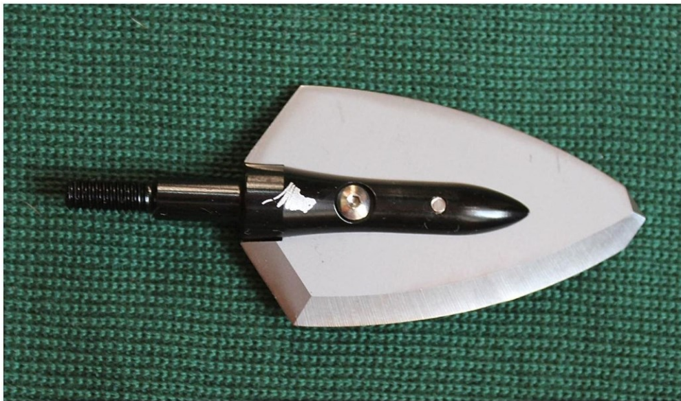
Figure 1: The Maasai 200 grain broadhead

The Maasai 200 grain broadhead consists of a thick (1.75 mm / .69 inches) 440C stainless steel single blade screwed onto a CNC aircraft grade, smooth transition, low profile ferrule of .334 inch (....mm) diameter (Figure 1).