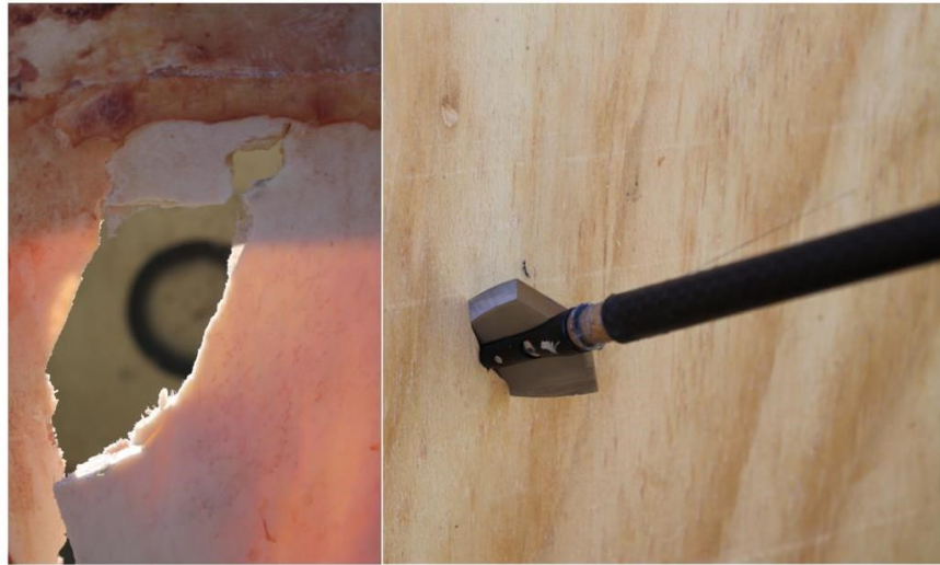
Figure 3: The broadhead punched a large hole through the bovine scapula and embedded 16mm into 20mm shutter board.

The broadhead penetrated 256 mm into a foam block and punched a large hole through a bovine scapula (Figure 3 and 5). The arrow deflected slightly on exit and instead of entering the foam backstop hit into the 20mm wooden shutter board used as an additional safety backstop, penetrating to a depth of 16mm. Apart from the fact that the insert had come loose from the shaft, the broadhead, even after having to be worked loose with a pair of pliers was “good to go” with only a few very small nicks in the cutting edge.