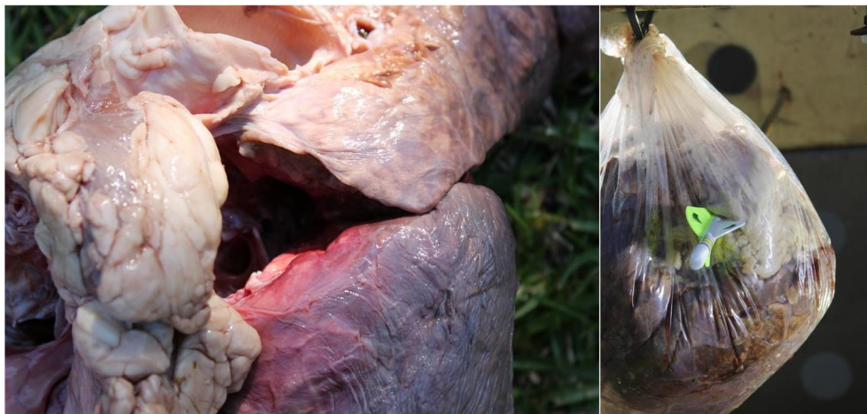
Figure 4: A large triangular wound channel through a bovine heart.

The same broadhead sailed through a bovine heart and created a large triangular wound channel (Figure 4 and 5).