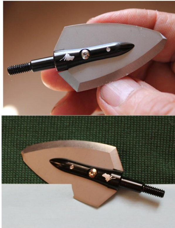
Figure 2: The Maasai was shaving sharp right out of the box and passed both the fingernail and paper test.

The average weight of the 3 broadheads sent for testing was 198 grains – 2 grains less than the advertised 200 grains. The broadhead passed the finger nail and paper test (Figure 2) - the blades are shaving sharp straight out of the box.