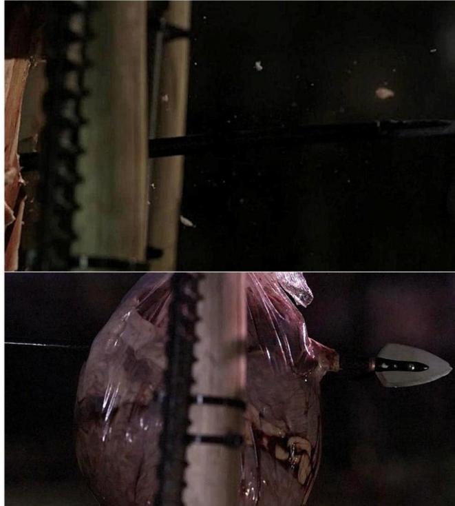
Figure 5: High speed footage of the Maasai penetrating through a bovine scapula and heart.

The broadhead was now repeatedly shot into our newly developed composite “animal” test model.