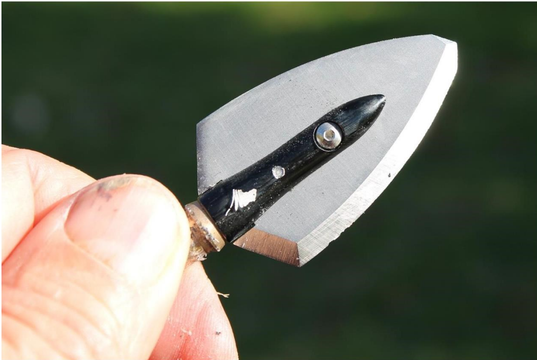
Figure 7: The same broadhead after all the tests described – with NO re-sharpening!

The same broadhead used for foam penetration, bovine scapula test (which ended up 16mm deep in shutter board), heart test and being shot 3 times into the test “animals” (including penetrating a total of 20mm thick bone) is shown in Figure 7.