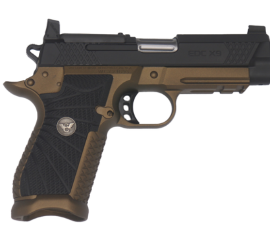
Wilson Combat EDC X9 Burnt Bronze Lightrail Frame ... $3535