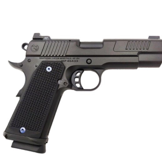
Nighthawk Custom Ambassador Series Delegate, .45ac... $4798.99