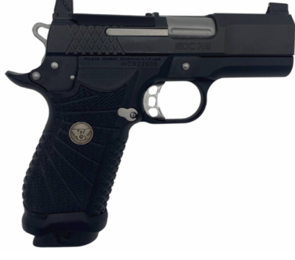
Wilson Combat EDC X9 9mm 3.25" Non-Lightrail Frame... $3535