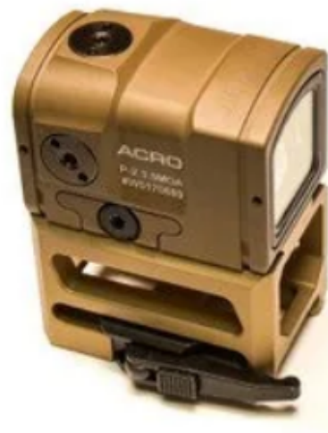
Aimpoint ACRO P-2 3.5 MOA Flat Dark Earth w/39mm m... $799