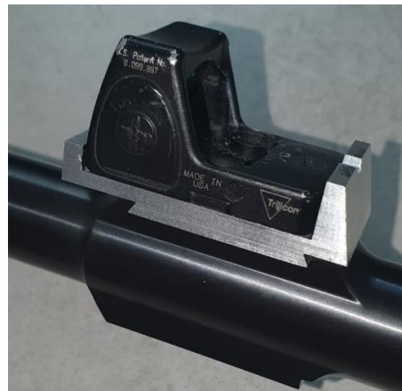
The test base was cut from Aluminium and an old Trijicon RMR was inserted to test the footprint.

With the test Base we could see that the RMR could go nowhere with a ramp at the back and front recoil would not be able to move the reflex sight. The base inserts from the side and is fasten down with grub screws. We also decided to do a backup and cut in a V same height as the original if something would fail on the reflex sight you can remove it and use the rifle with normal open sight in case of emergency. With the alumium base showing us what we needed to know MRS Techniques went ahead and cut the next base from steel. With steel we could drop the thickness of the base a bit and lower the mount even more.