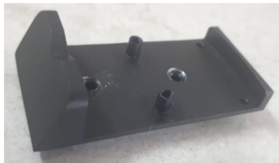
The Steel base which doesn't look as clumsy as the aluminium test base

The base is built with the footprint for Trijicon and Holosun for the moment but can be build to accept all other reflex sight brands like Leopold, Vortex and Aimpoint.