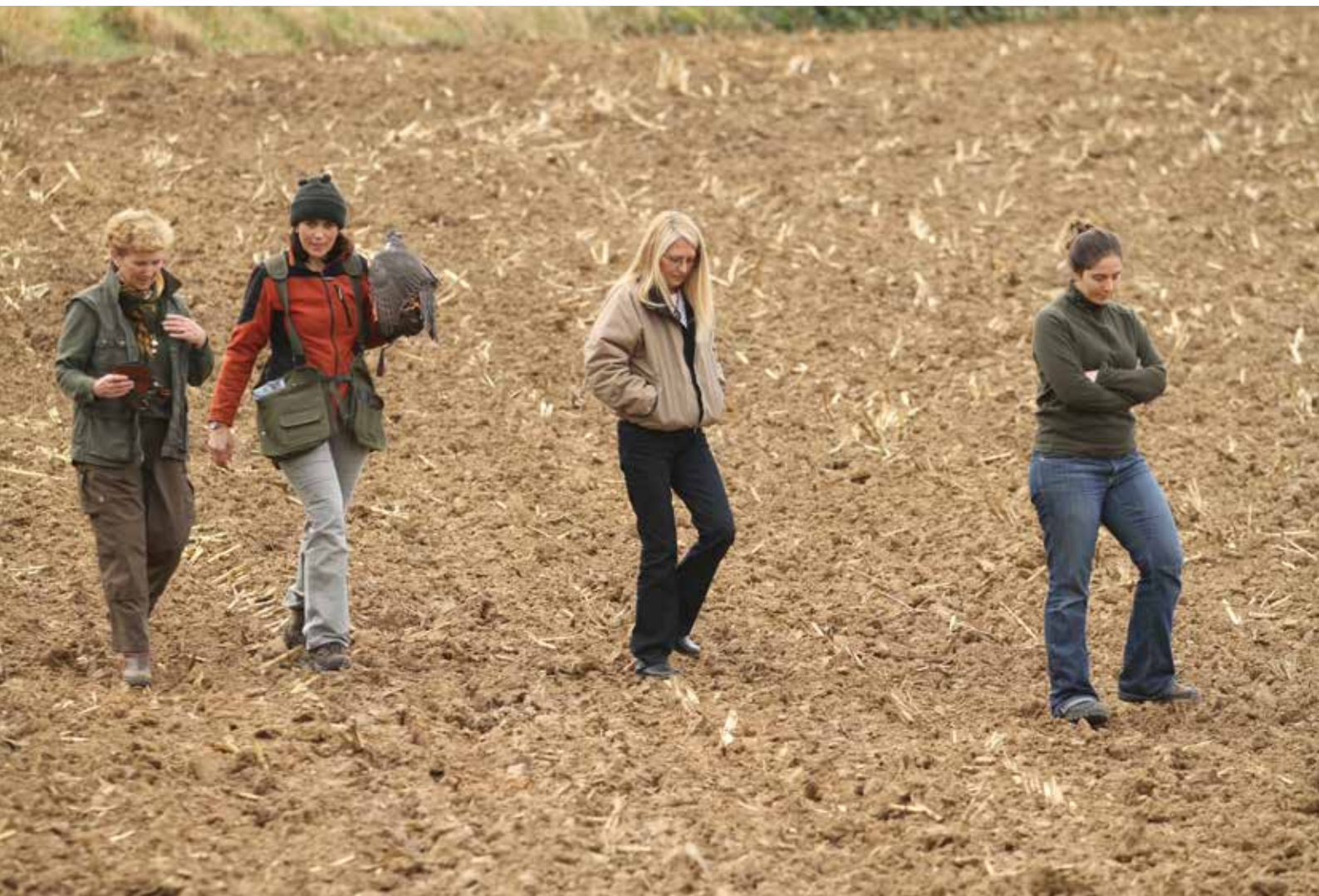
First meet of the IAF Womens Working Group in Belgium